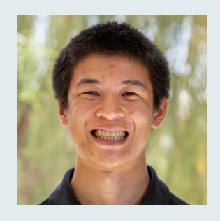
"APASA is my second home. The people there are always helpful, enjoying each others company and looking out for each other like a family."