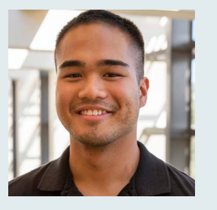
"APASA is like having a second family who makes a big university feel more like home."